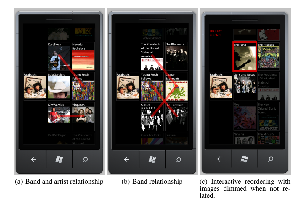
Figure 3. Applying GraphTiles to Seattle's music band data.

taining a large cross section of its database (approximately 3GB in size). We then randomly selected 60 nodes within the IMDb graph describing well-known actors (supporting PMP queries), and 60 nodes describing well-known movies (supporting MPM queries). We then sampled the two-link neighborhood around each actor (PMP) node by adding the top movies linked to it as indicated by IMDb's own API call; and then for each of those top movies, adding its top actors, again as indicated by IMDb's API call. We created two-link neighborhoods around movie (MPM) nodes similarly. The number of top movies returned by IMDb's API was generally much lower than the number of top actors.