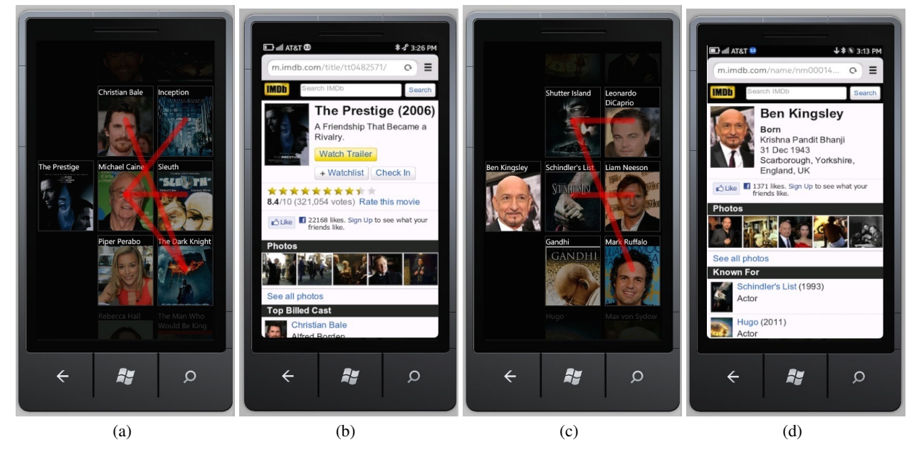
Figure 1. Comparing GraphTiles with IMDb's mobile website. (a) and (b): The MPM(Movie-person-movie) QueryType ; (c) and (d): the PMP(Person-movie-person) QueryType .