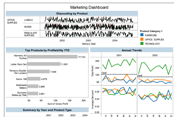
Figure 1: Select metrics that matter

Choosing the metrics to include in the dashboard is critical. Above all, they must be metrics that matter and that are relevant to the marketing job at hand. But that doesn't mean every marketing metric should be included – far from it. You should be highly selective in determining which metrics earn a spot on your dashboard. In order to find the right set of metrics to include, you need to consider the following: