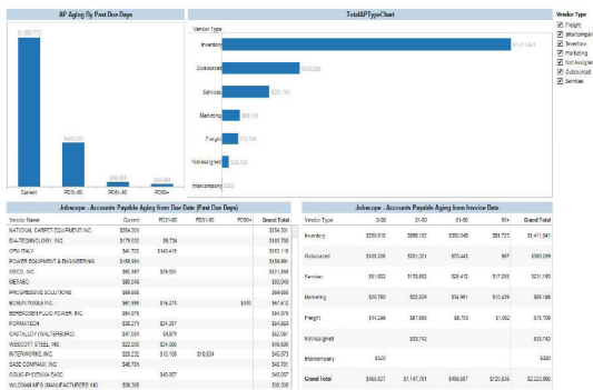
Weekly Accounts Payable Dashboard

Dashboards provide a better and faster way to see and understand patterns and trends.