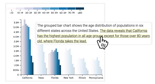
Figure 3: Example of an incorrect statement generated by the LLM (contrary to the text, the chart shows that Florida does not have a higher number of people over the age of 80 compared to California). The text→chart linking feature helps verify the statement and identify the erroneous interpretation by dynamically highlighting the two states.

Figs. 1 and 2D). Besides improving readability, our motivation to include this text→chart linking was also that visually seeing the data being referred to in the text could serve as a quick verification for potential hallucinations or incorrect interpretations by the LLM (e.g., Fig. 3). Authors can then redact the stories themselves, and their edits are shown in a different italicized format.