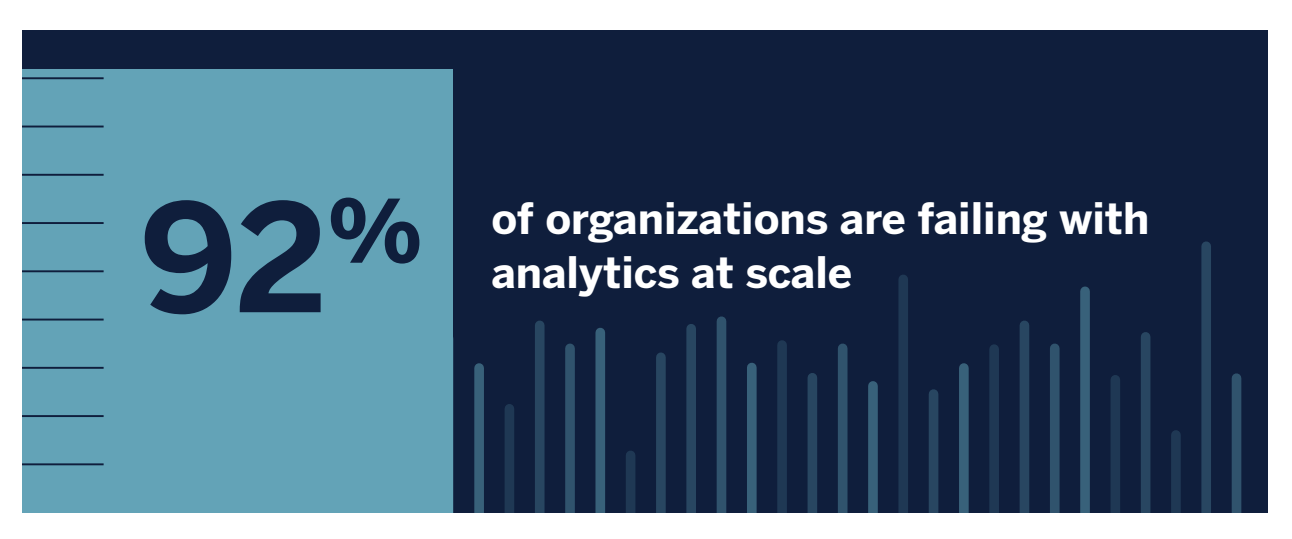
Source: "Catch them if you can: How leaders in data and analytics have pulled ahead," McKinsey, September, 2019 Survey

Case in point: A large retailer with nationwide locations had difficulty stocking the right products in the right stores; one location might sell out of a product completely while a store in another region had a surplus of the same product.