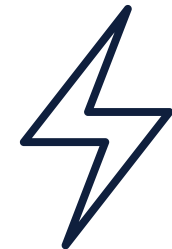
Tableau gives you a view of your customers at every touchpoint, so that you can target the right customer at the right time.